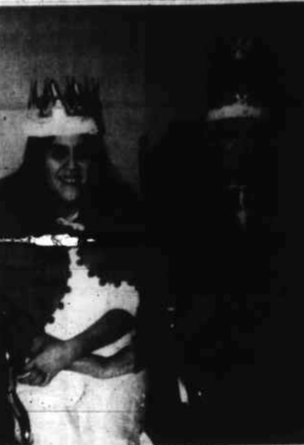
On February 14th, a Valentine Party was held for the residents of Heritage House. The special event was the crowning of the King and Queen, elected by residents' vote.